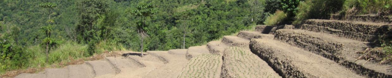
Terracing is one of WFP asset creation activities in Chin State.